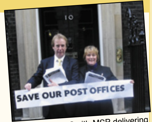
With Margaret Smith MSP delivering petition to 10 Downing Street

Many local residents contacted me regarding the misuse of fireworks and I have actively supported legislation that will restrict the time of year and the time of day fireworks can be set off. This legislation has successfully passed through the House of Commons.